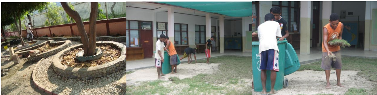
Everyone working together to build the sandpit and fill with clean sand