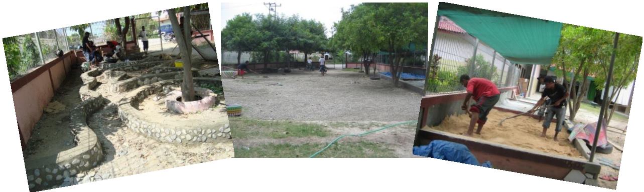
The Kindergarten playground with the new sandpit