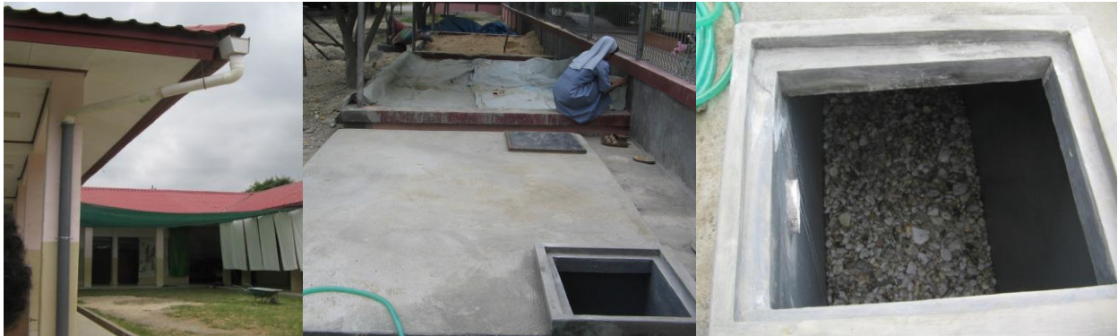
The construction of the tank with the two sections

Rain water collected from the roof and is filtered into the first tank by three layers of pebbles and sand, the water then flows into the storage tank through the three pipes in photo three. The storage tank is easily accessed to facilitate monitoring the water level and cleaning the tank.